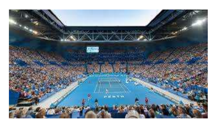
6) Which country won tennis' prestigious Hopman Cup for 2018 on 6 January 2018? – Switzerland